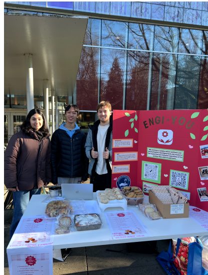
(Left to right): Valentines candy grams, free breakfast event, bake sale – 2024-2025 year