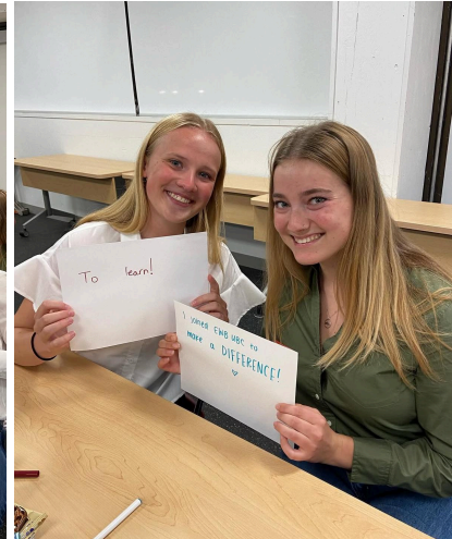
Image taken at October 2022 General Meeting. Members were asked what EWB means to them.