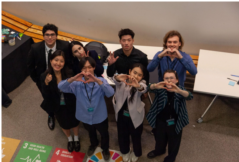
Image taken at the 2024 BC Regional xChange Conference