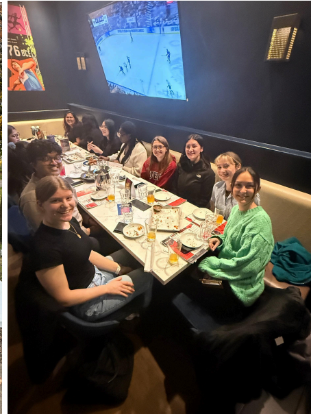
2024 Halloween Treat fundraiser (left), February social (right)