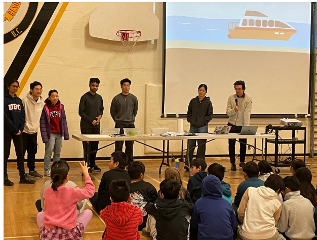
Image taken from 2025 Youth Venture event where team members hosted a workshop for local elementary school students.

Our team meets in person on Wednesdays from 6:30pm-8:00pm to work collaboratively within and between ventures. We value learning from each other and sharing ideas, which means our project teams are eager to support each other's missions. Our executive team supports and uplifts ventures through sponsorships, community connections, and tinkering logistical issues. We emphasize that all of our members are equally able to contribute great ideas and support to peers.