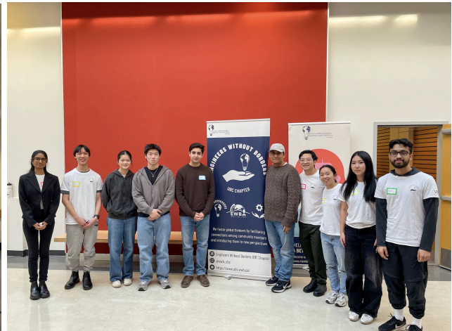
Youth Venture Case Competition 2025