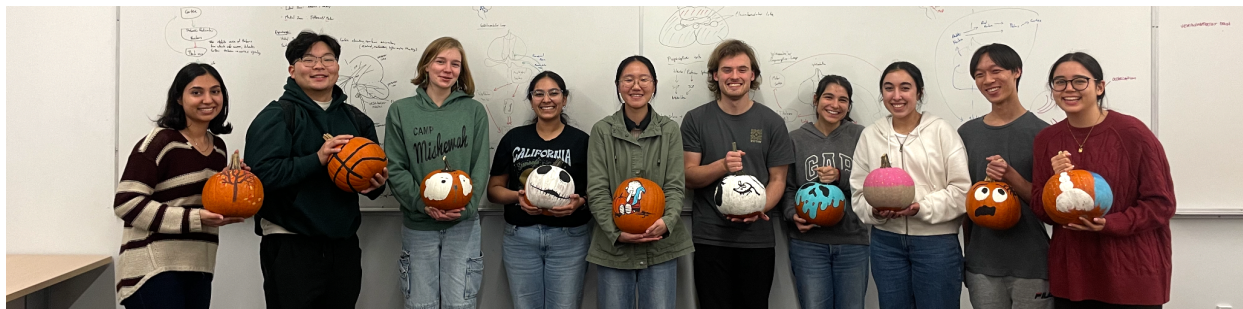
Internal pumpkin painting event – Halloween 2024

Engi-YOU Wellness seeks to empower engineering students to lead healthier, more fulfilling lives by promoting physical fitness, mental well-being and emotional development. We are investing in undergraduate engineering students, future professional engineers, consultants, and entrepreneurs who are committed to innovative engineering solutions that protect the planet and enhance various sectors for current and future generations.