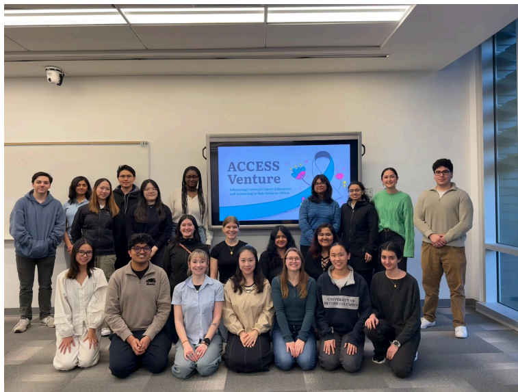
Image taken from 2025 stakeholder presentations